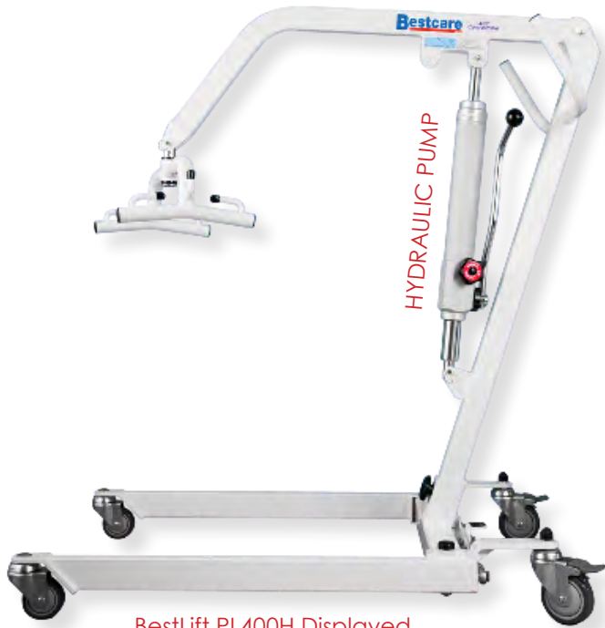
BestLift PL400H Displayed