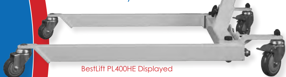
BestLift PL400HE Displayed